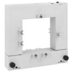
Current transformers DM2TA1000 Split-core