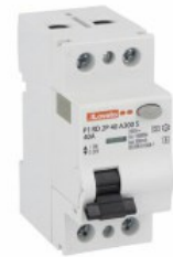
Residual current circuit breakers (RCCB) selective P1RD 2P 2 IEC