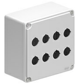
Enclosures with cut-outs for Ø22mm units - with multiholes for 8 actuators LPZM