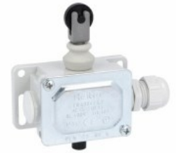
Top roller push plunger PLN...R