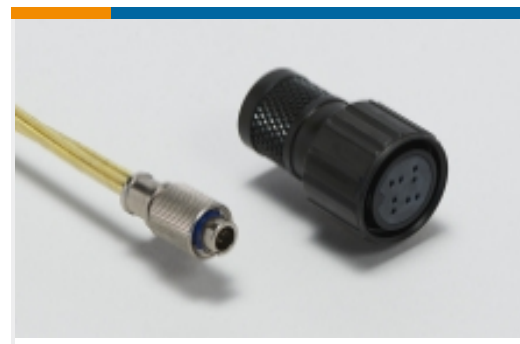
Standard Circular Connectors(519)