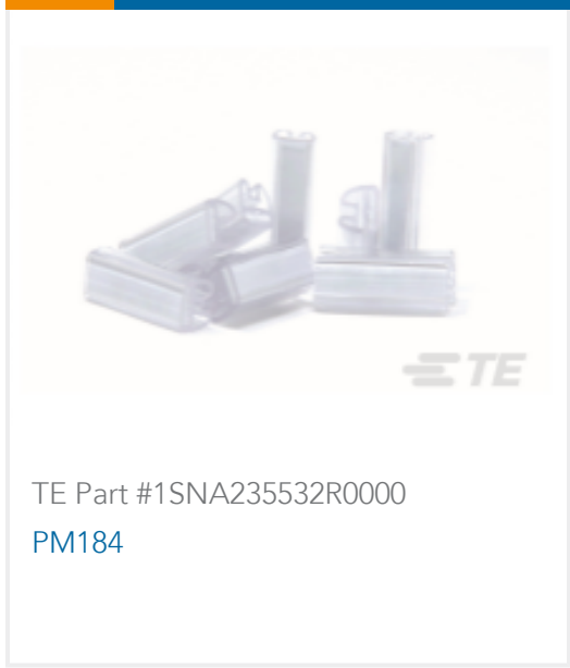
TE Part #1SNA235532R0000 PM184