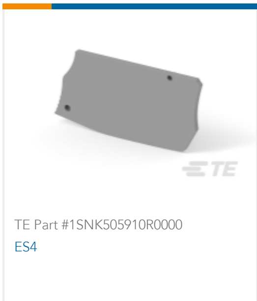
TE Part #1SNK505910R0000 ES4