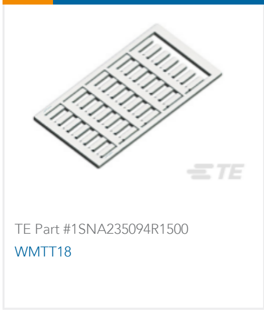
TE Part #1SNA235094R1500 WMTT18