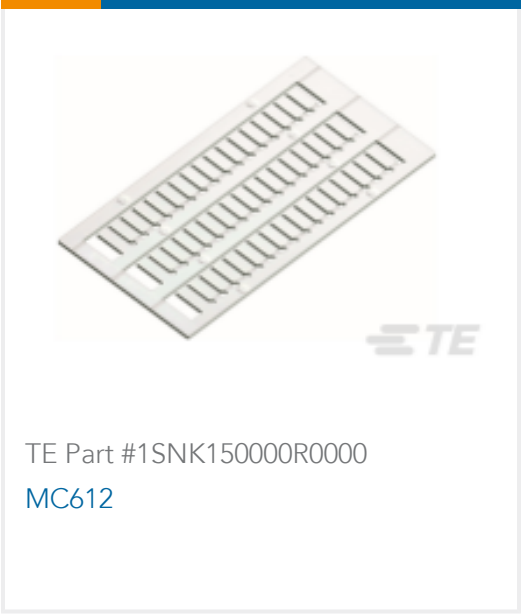
TE Part #1SNK150000R0000 MC612