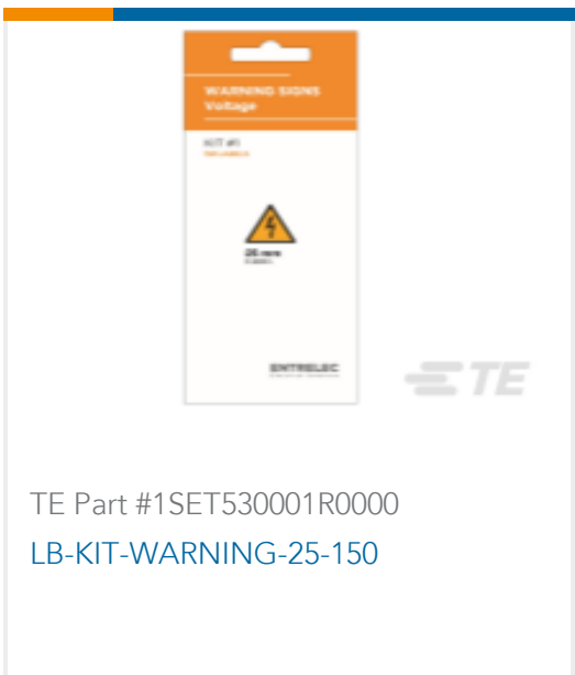
TE Part #1SET530001R0000 LB-KIT-WARNING-25-150