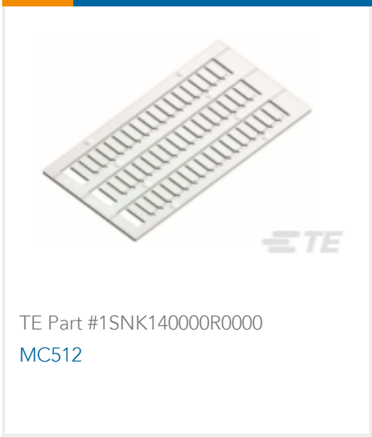
TE Part #1SNK140000R0000 MC512