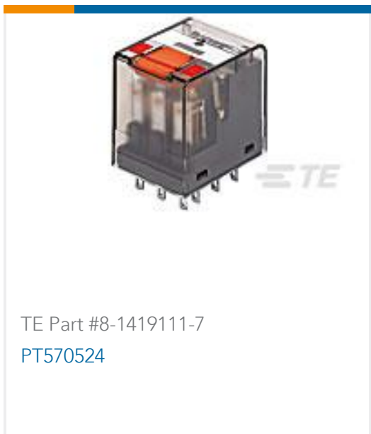
TE Part #8-1419111-7 PT570524