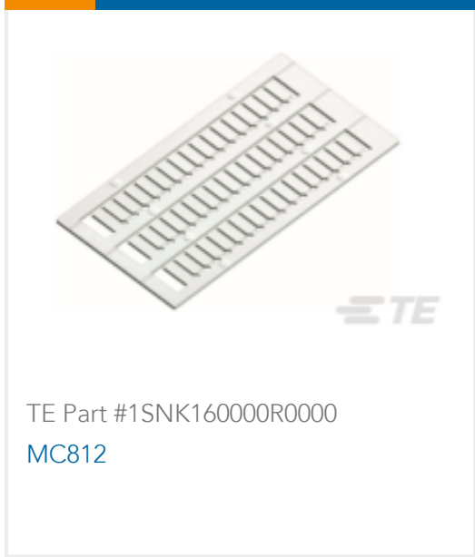
TE Part #1SNK160000R0000 MC812