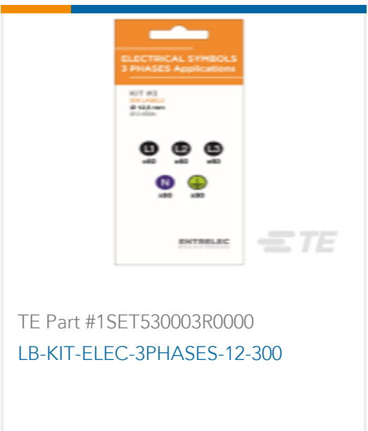
TE Part #1SET530003R0000 LB-KIT-ELEC-3PHASES-12-300