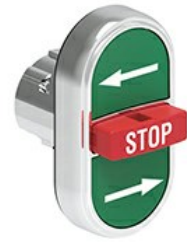
Triple-touch actuators, spring return - One middle extended buttons LPSB73