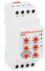
Frequency monitoring relays PMF20