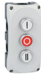
Grey control station LPZP3A8 complete with white flush pushbutton "i" LPCB1118 1NO, red flush pushbutton "o" LPCB1104 1NC and white flush pushbutton "ii" LPCB1128 1NO LPZP3B8904