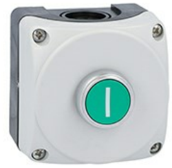
Grey control station LPZP1A8 complete with green flush pushbutton "I" LPCB1113 1NO LPZP1B8100