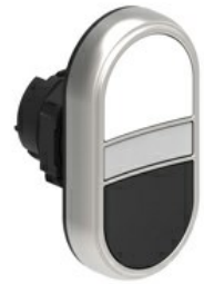
Double-touch actuators, spring return white indicator - Two flush pushbuttons LPCBL71