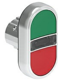
Double-touch actuators, spring return white indicator - Two flush pushbuttons LPSBL71