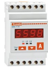
Metering instruments - Ammeter DMK71R1 3