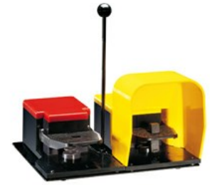
Two pedal, left pedal with free actuation and right pedal with safety lever - left open right with cover KG D003