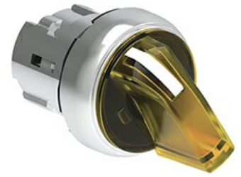
Illuminated selector switch actuator - 3 position LPSSL13