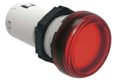
LED integrated monoblock pilot lights steady light LPML