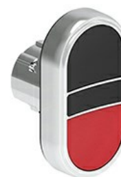
Double-touch actuators, spring return - two flush pushbuttons LPSB71