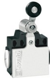
Roller lever plunger KCE