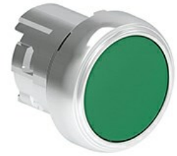
Pushbutton actuator, spring return LPSB10