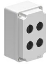
Enclosures with cut-outs for Ø22mm units - with multiholes for 4 actuators LPZM