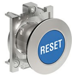
Pushbutton actuators, spring return, with symbol LPFB11