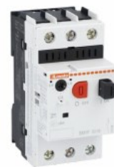
Motor protection circuit breaker SM1P