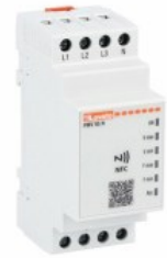
Multifunction voltage and frequency monitoring relays with NFC technology PMV95N