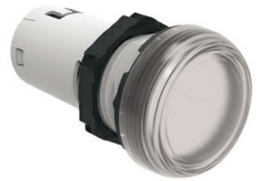
LED integrated monoblock pilot lights steady light LPML