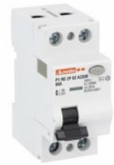
Residual current circuit breakers (RCCB) P1RD 2P 2 IEC