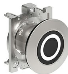
Pushbutton actuators, spring return, with symbol LPFB11