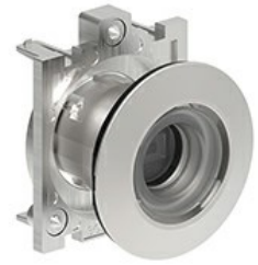
Illuminated actuator without cap LPFXQL0