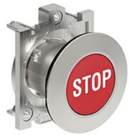
Pushbutton actuators, spring return, with symbol LPFB11