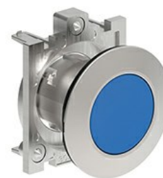
Pushbutton actuator, spring return LPFB10