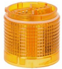
Signal tower Ø50mm/1.97" LTN50