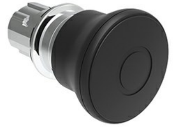
Mushroom head pushbutton, Latch, pull to release Ø 40mm/1.6" LPSB674