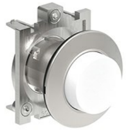
Pushbutton actuator, spring return LPFB20