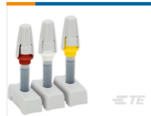
TE Part #1SNA360101R1200 AMS PEN 0.35