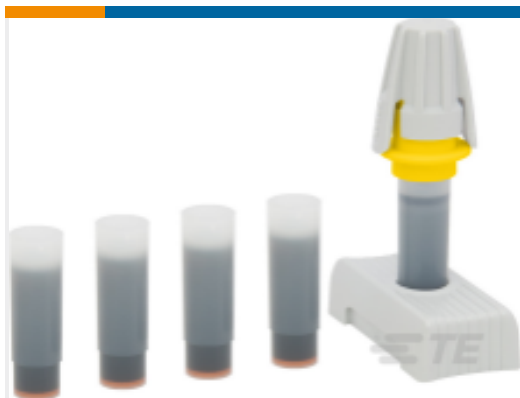
TE Part #1SNA360150R2600 AMS INK CARTRIDGES