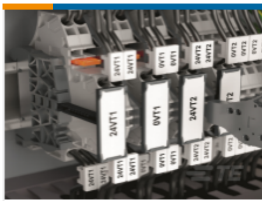
TE Part #1SNK900630R0000 MCLH