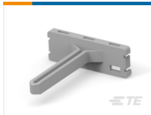
TE Part #1SNA399719R1000 PEAD