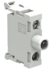
LED elements steady light base mount on LPZ control station LPXLPB