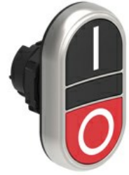
Double-touch actuators, spring return - two flush pushbuttons LPCB71