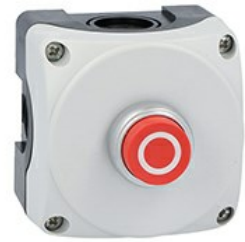
Grey control station LPZP1A8 complete with red extended pushbutton "o" LPCB2104 1NC LPZP1B8104