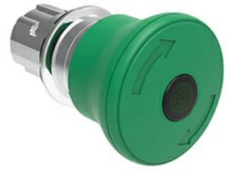
Illuminated mushroom head button actuators - Latch, turn to release Ø 40mm/1.6" LPSBL66