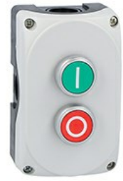
Grey control station LPZP2A8 complete with green flush pushbutton "i" LPCB1113 1NO and red flush pushbutton "o" LPCB1104 1NC LPZP2B8900