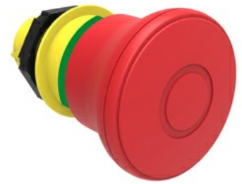
Mushroom head pushbutton, Latch, pull to release Ø 40mm/1.6" LPCB674