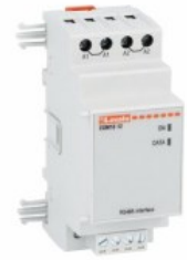
Expansion modules for modular products - communication port EXM1012