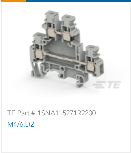
TE Part # 1SNA115271R2200 M4/6.D2