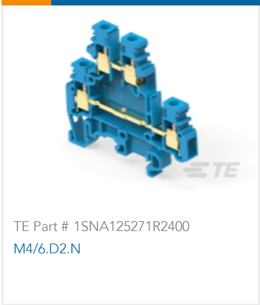
TE Part # 1SNA125271R2400 M4/6.D2.N