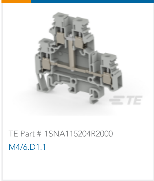
TE Part # 1SNA115204R2000 M4/6.D1.1