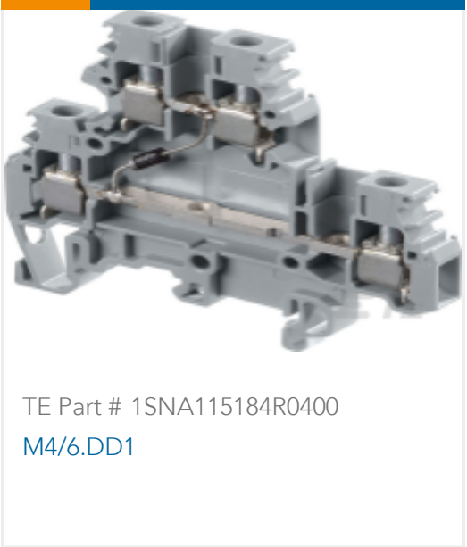
TE Part # 1SNA115184R0400 M4/6.DD1