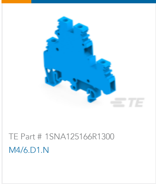
TE Part # 1SNA125166R1300 M4/6.D1.N