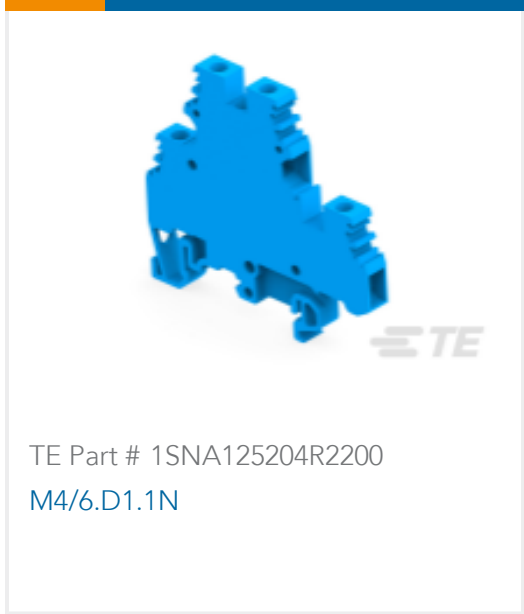
TE Part # 1SNA125204R2200 M4/6.D1.1N