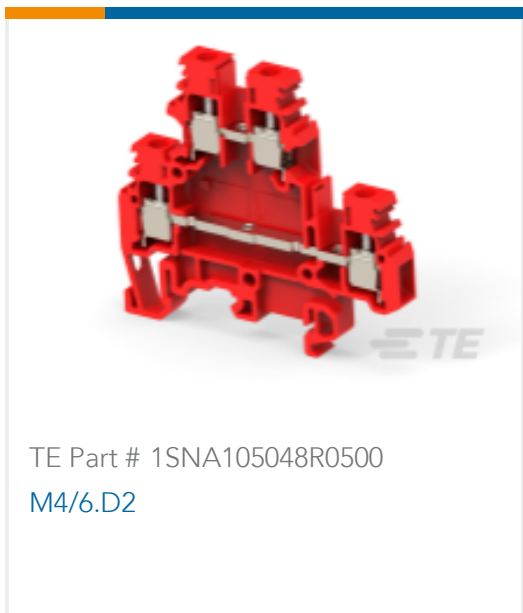
TE Part # 1SNA105048R0500 M4/6.D2