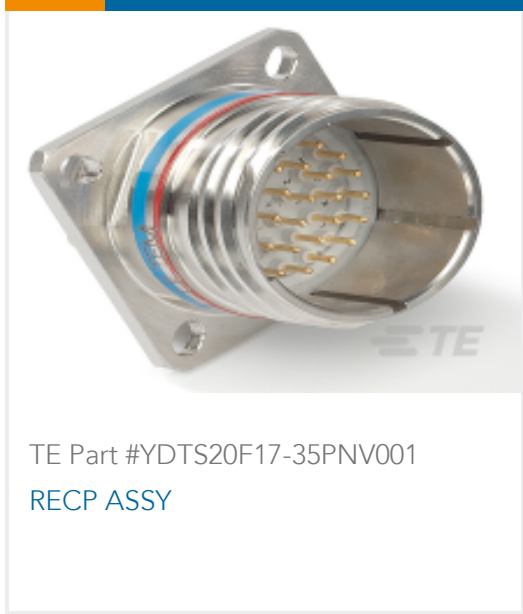
TE Part # YDTS20F17-35PNV001 RECP ASSY