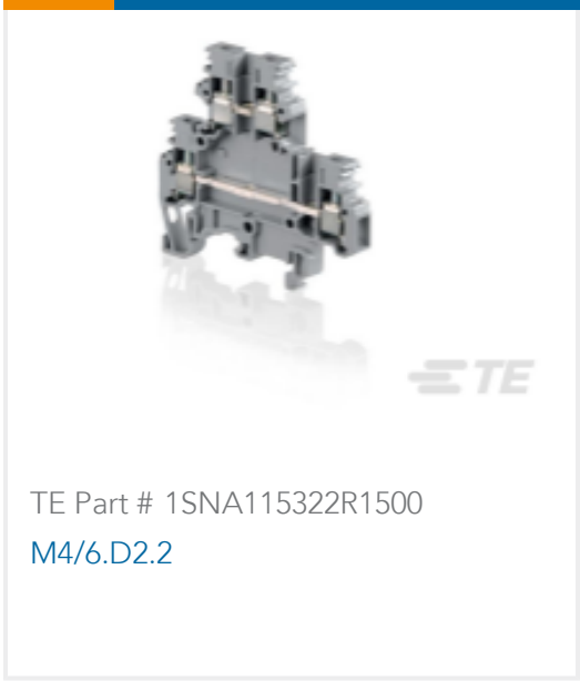
TE Part # 1SNA115322R1500 M4/6.D2.2