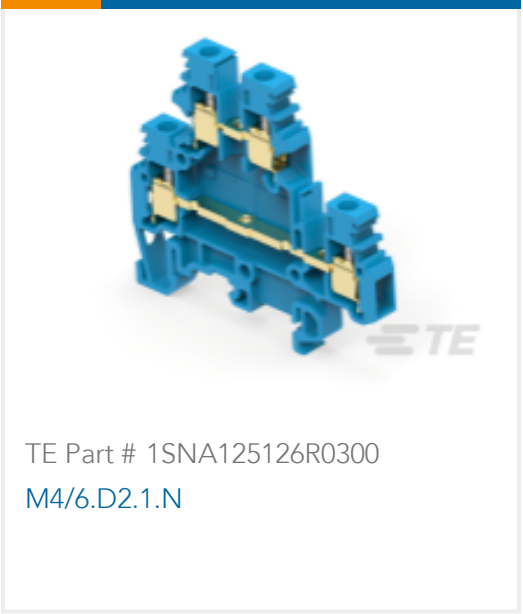
TE Part # 1SNA125126R0300 M4/6.D2.1.N