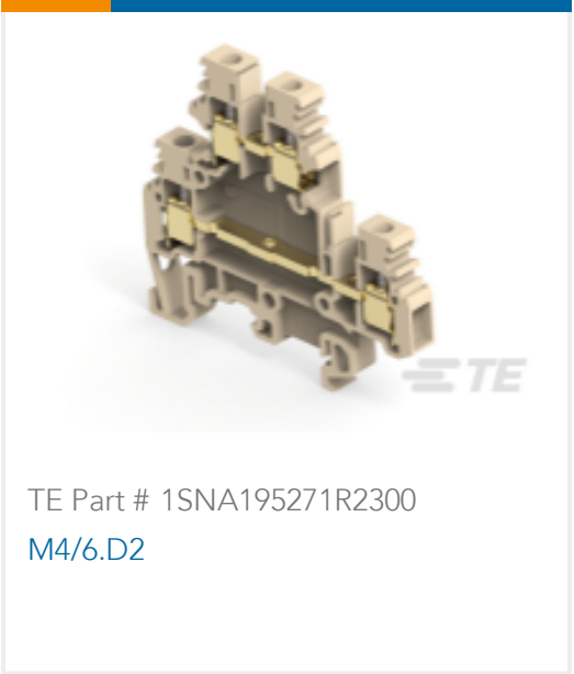
TE Part # 1SNA195271R2300 M4/6.D2