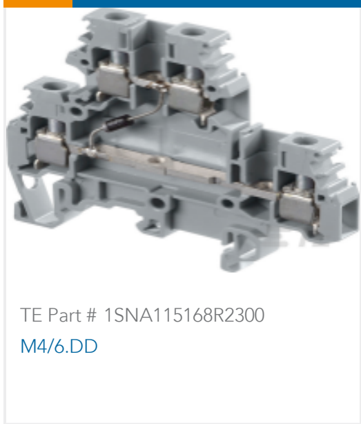
TE Part # 1SNA115168R2300 M4/6.DD