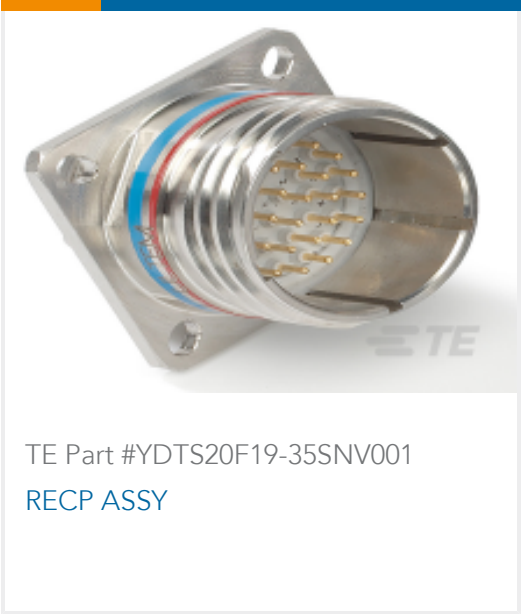
TE Part # YDTS20F19-35SNV001 RECP ASSY