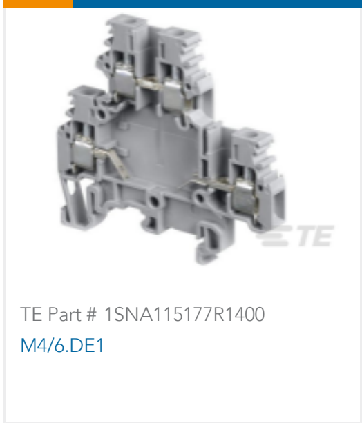
TE Part # 1SNA115177R1400 M4/6.DE1