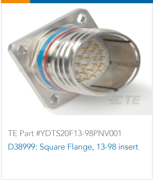
TE Part # YDTS20F13-98PNV001 D38999: Square Flange, 13-98 insert