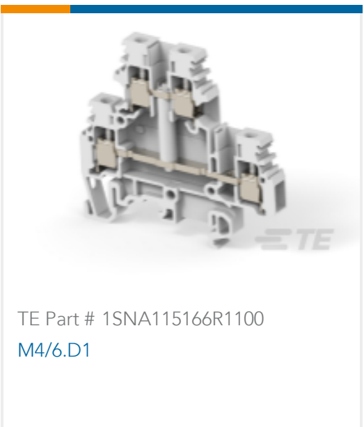
TE Part # 1SNA115166R1100 M4/6.D1