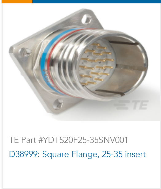
TE Part # YDTS20F25-35SNV001 D38999: Square Flange, 25-35 insert