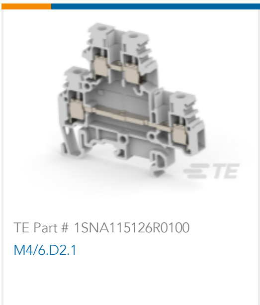
TE Part # 1SNA115126R0100 M4/6.D2.1