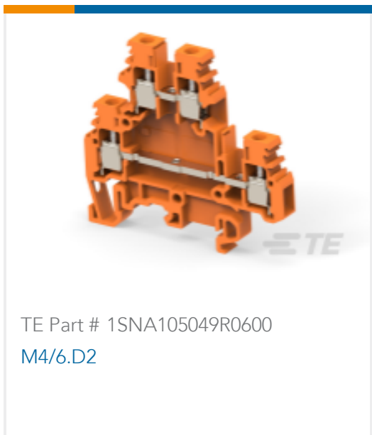
TE Part # 1SNA105049R0600 M4/6.D2