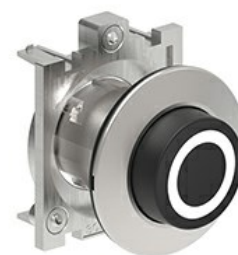
Pushbutton actuators, spring return, with symbol LPFB21