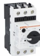
Motor protection circuit breaker SM1R