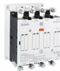
Power contactor BF195