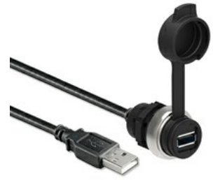
USB interface, A/A female type connection with 1m long cable LPCD0