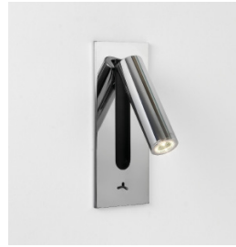
CODE: 1215035 FINISH: POLISHED CHROME