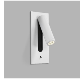
CODE: 1215036 FINISH: MATT WHITE