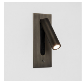
CODE: 1215038 FINISH: BRONZE