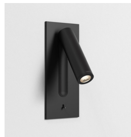
CODE: 1215037 FINISH: MATT BLACK