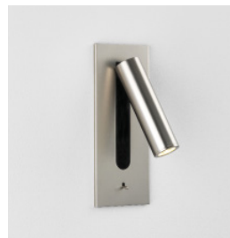
CODE: 1215039 FINISH: MATT NICKEL

TO MAINTAIN THIS PRODUCT TO ITS BEST CONDITION, PLEASE VIEW OUR CARE AND CLEANING GUIDE ON THE SUPPORT SECTION OF THE ASTRO WEBSITE.