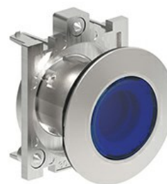
Illuminated button actuators, spring return - Flush LPFBL10