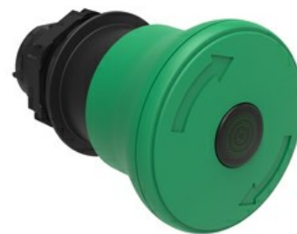
Illuminated mushroom head button actuators - Latch, turn to release Ø 40mm/1.6" LPCBL66