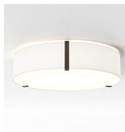
CODE: 1463002 FINISH: WHITE FABRIC