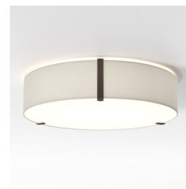
CODE: 1463004 FINISH: PUTTY FABRIC

TO MAINTAIN THIS PRODUCT TO ITS BEST CONDITION, PLEASE VIEW OUR CARE AND CLEANING GUIDE ON THE SUPPORT SECTION OF THE ASTRO WEBSITE.