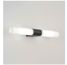
CODE: 1143008 FINISH: MATT BLACK

TO MAINTAIN THIS PRODUCT TO ITS BEST CONDITION, PLEASE VIEW OUR CARE AND CLEANING GUIDE ON THE SUPPORT SECTION OF THE ASTRO WEBSITE.