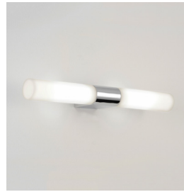
CODE: 1143001 FINISH: POLISHED CHROME